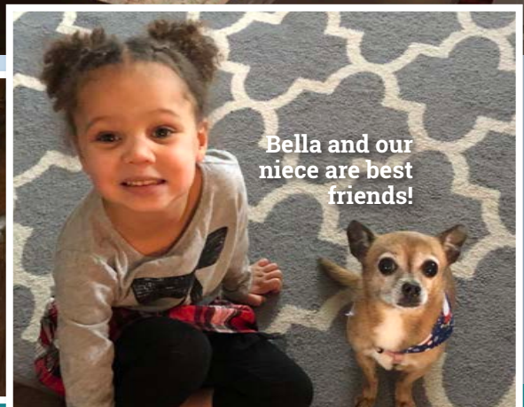
Bella and our niece are best friends!

We love living in central North Carolina and finished building our forever home in 2018. We enjoy living in our small community and being able to take quick trips to the beach and mountains on the weekends. We especially love taking day trips to the beach!