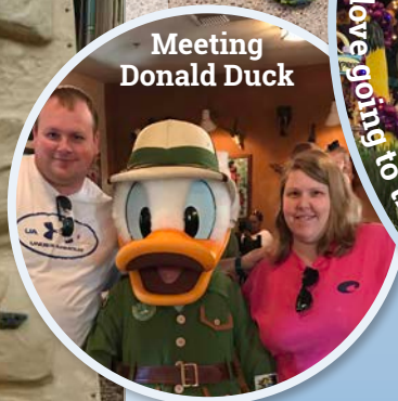
Meeting Donald Duck