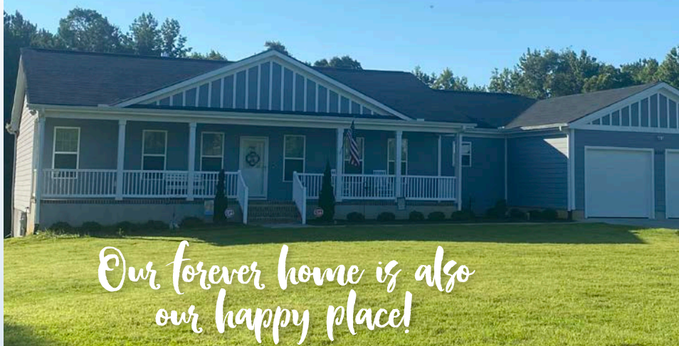
Our forever home is also our happy place!

We absolutely adore our dogs Gunnar & Bella! Gunnar is a three-year-old cavapoo and Bella is a ten-year-old chihuahua. They love lots of treats and snuggles and have never met a stranger. We enjoy taking them on walks and playing catch.