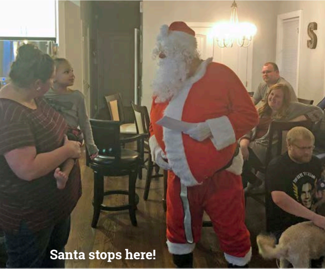
Santa stops here!

We love spending as much time with family as possible. Every year at Christmas Santa stops by our house to drop off gifts and spend time with our niece. We have had this tradition for four years and look forward to our future children getting to enjoy this!