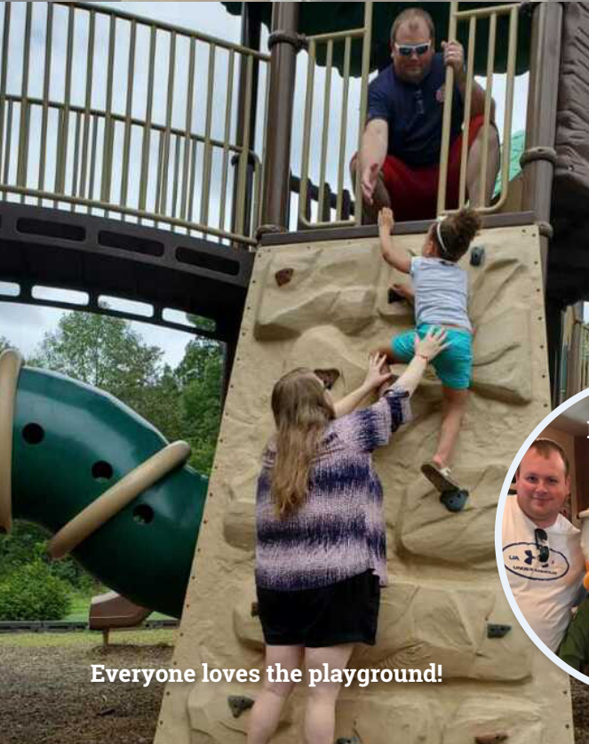
Everyone loves the playground!