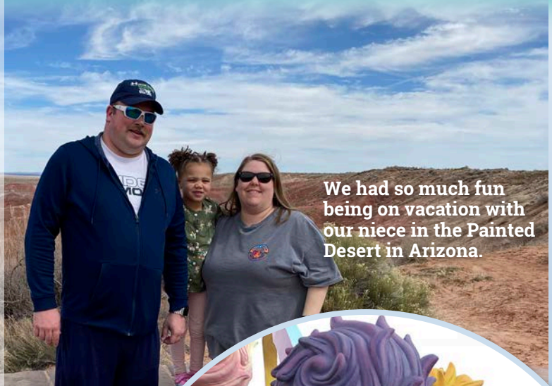
We had so much fun being on vacation with our niece in the Painted Desert in Arizona.

We love spending as much time with family as possible. Every year at Christmas Santa stops by our house to drop off gifts and spend time with our niece. We have had this tradition for four years and look forward to our future children getting to enjoy this!