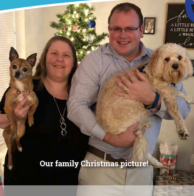
Our family Christmas picture!