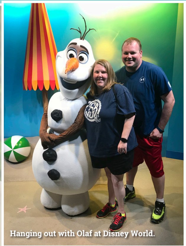
Hanging out with Olaf at Disney World.