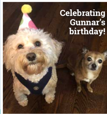
Celebrating Gunnar's birthday!