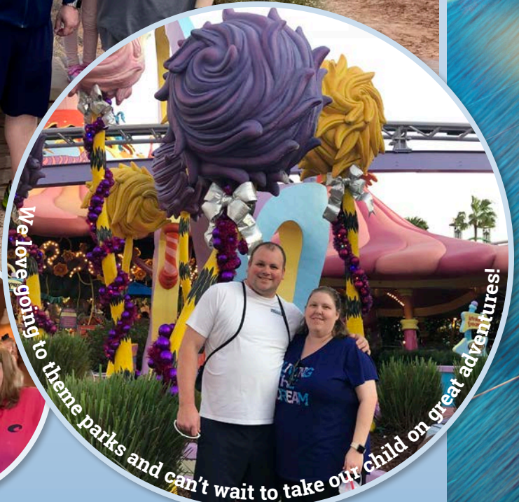
We love going to theme parks and can't wait to take our child on great adventures!